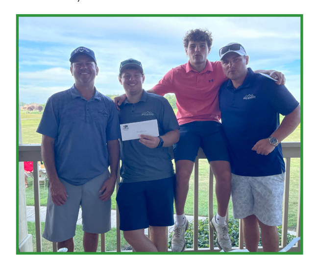
Grand Lake Roofing

Thank you to all who were involved in the annual Chamber golf outing that took place on Friday, September 2nd. We appreciate all who rearranged their schedules to play on this make up date. It takes a village to make this outing happen and we appreciate all who sponsored a hole sign, donated a prize, played in the tournament, purchased raffle tickets, and volunteered their time to assist at the outing. Thank you to Hole In One sponsors Stammen Insurance and Rino's Auto Sales. We also thank Bud's Chrysler for the proximity cash donations. Celina Lynx provided us with a great day of golf, and we appreciate all their assistance!! Congratulations to our two flight winners...Grand Lake Roofing and RRR Tire. It was a great day, and we can't wait to do it again next year. Mark your calendars for Friday, May 26, 2023, at the Mercer County Elks!